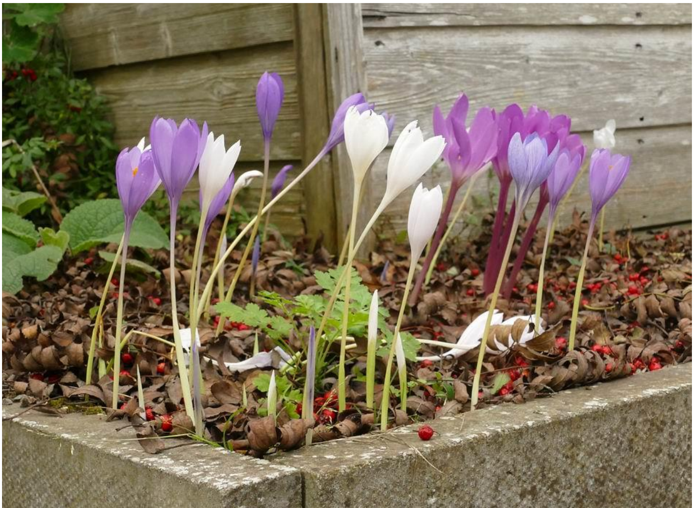
Flowering right now are colour forms of Crocus nudiflorus , Crocus speciosus and a dark flowered Colchicum .