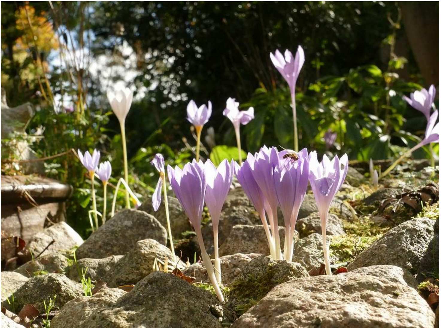
Crocus serotinus subsp. salzmannii adds its beauty to the cobble bed