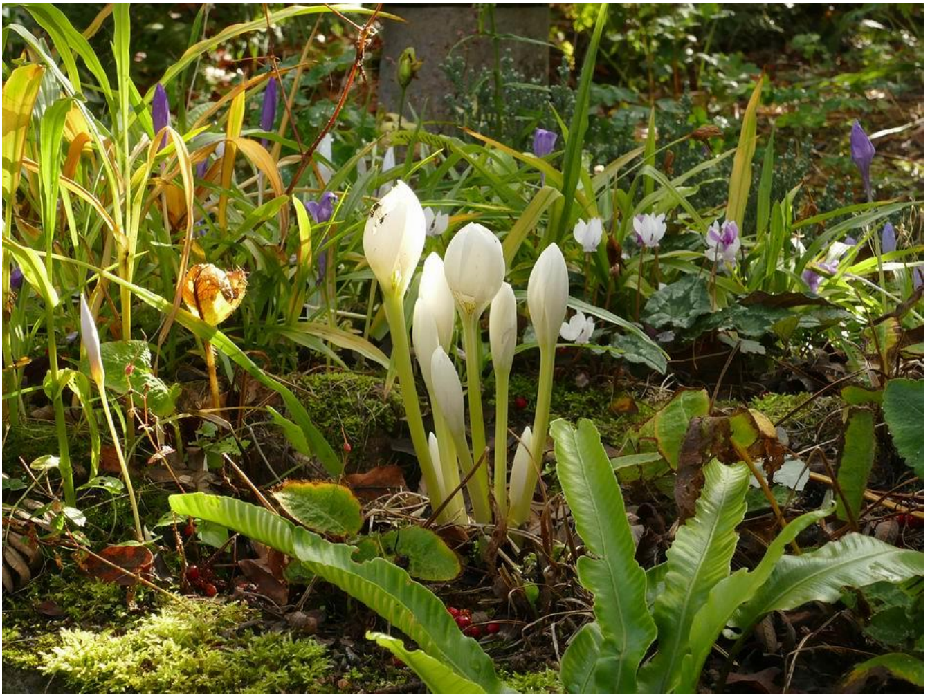
Colchicum speciosum album

Now to the autumn flowering bulbs which continue to bloom such as Colchicum speciosum in two forms .