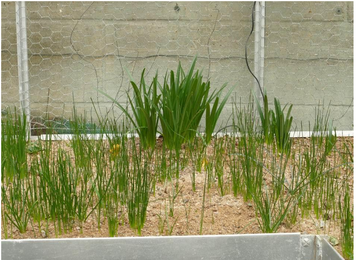
Bulb House Sand Bed

Now the flowers of the Sternbergia have faded the bulbs a vigorous growth of leaves has emerged, perhaps encouraged by the addition of a small pinch of extra fertiliser I scattered around them – later I will add a potassium supplement.