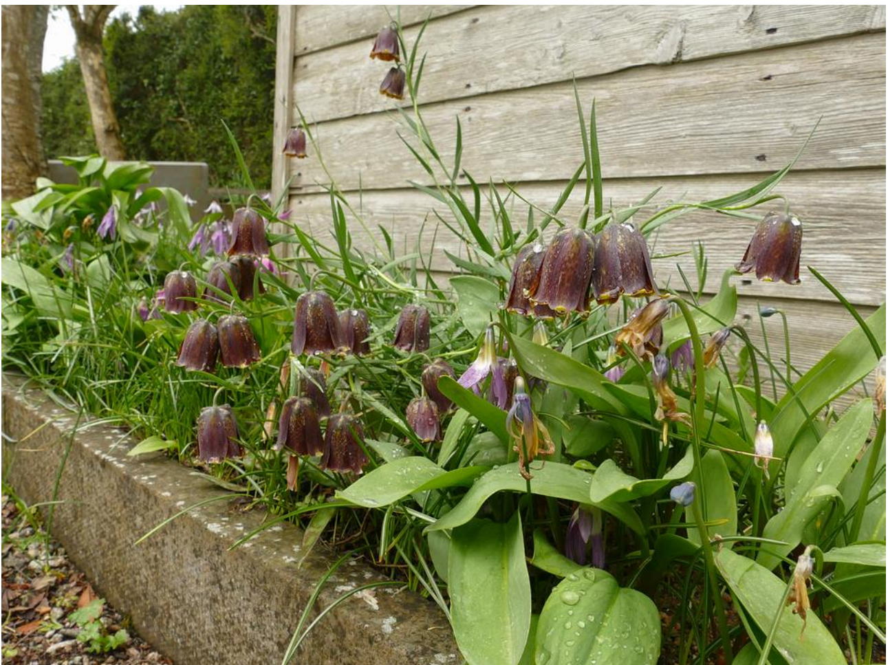
Jumping back to spring: as the Erythronium flowers faded, Fritillaria pyrenaica took to the stage after which the flowering subsided over the summer before the explosion of Crocus flowers appeared see below.