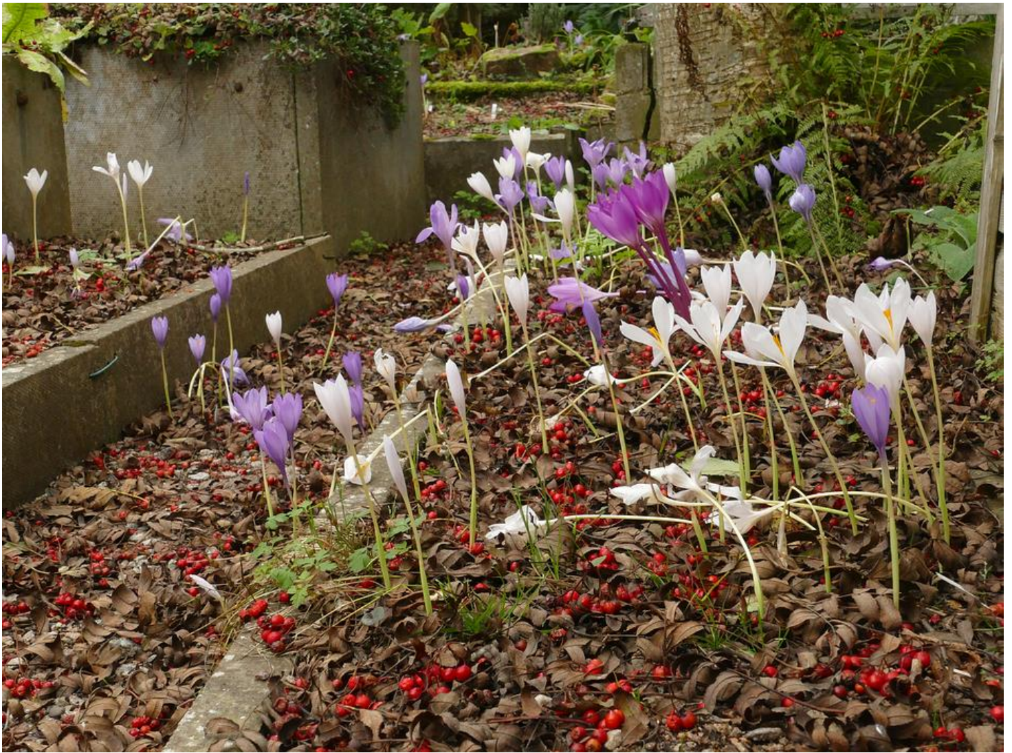
Autumn flowering Crocus time in the Erythronium bed.