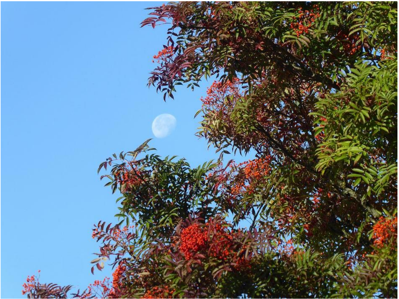
The berries on a Sorbus with a background of the moon in a clear blue morning sky are typical signs of autumn.