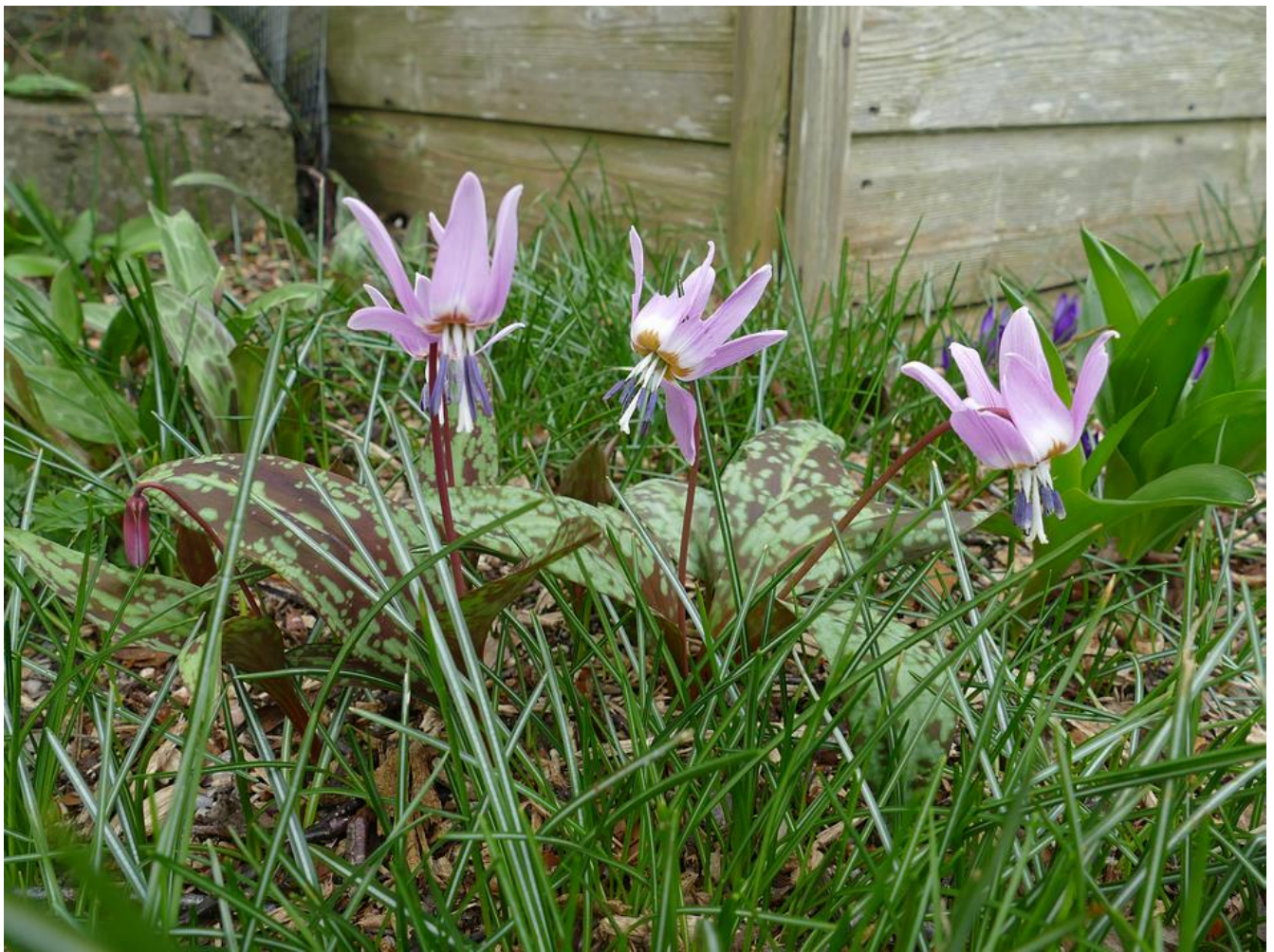
Erythronium dens-canis - Spring