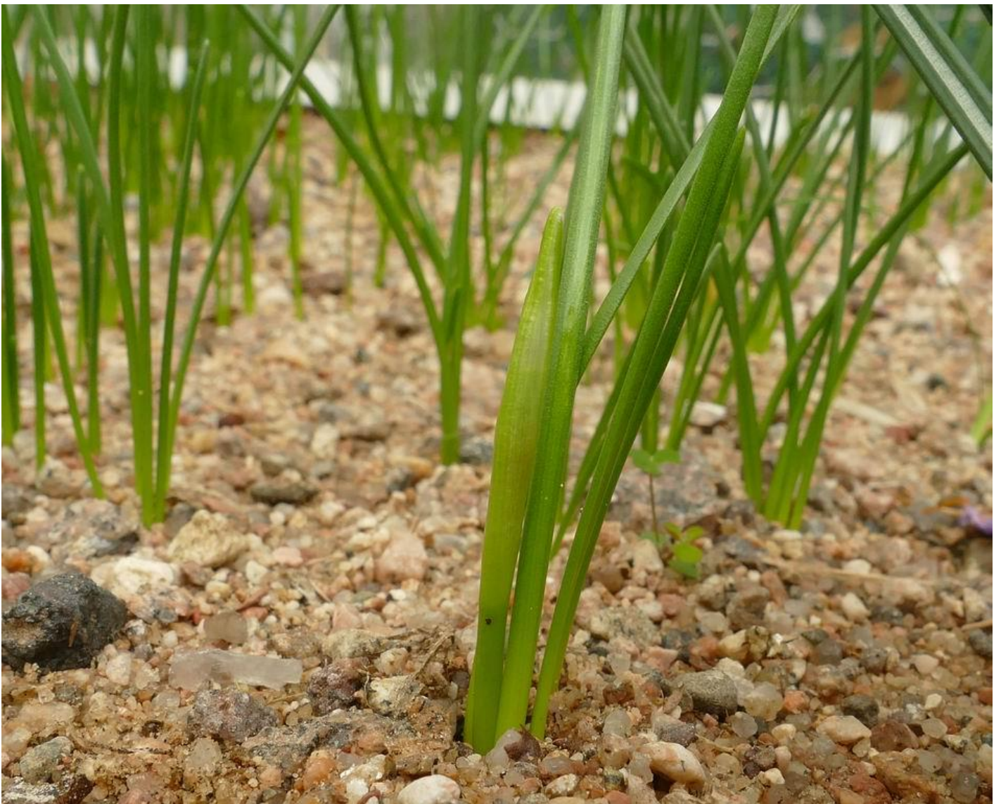
While checking I found the first of this year's Narcissus buds , above, poking through the sand also fat Crocus buds , below, full of promise.