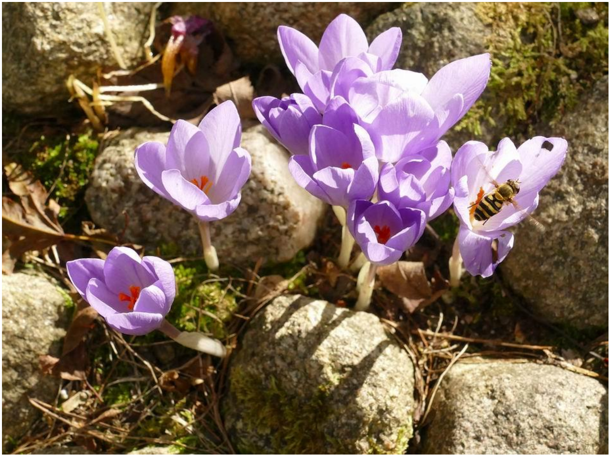
Crocus serotinus subsp. salzmannii