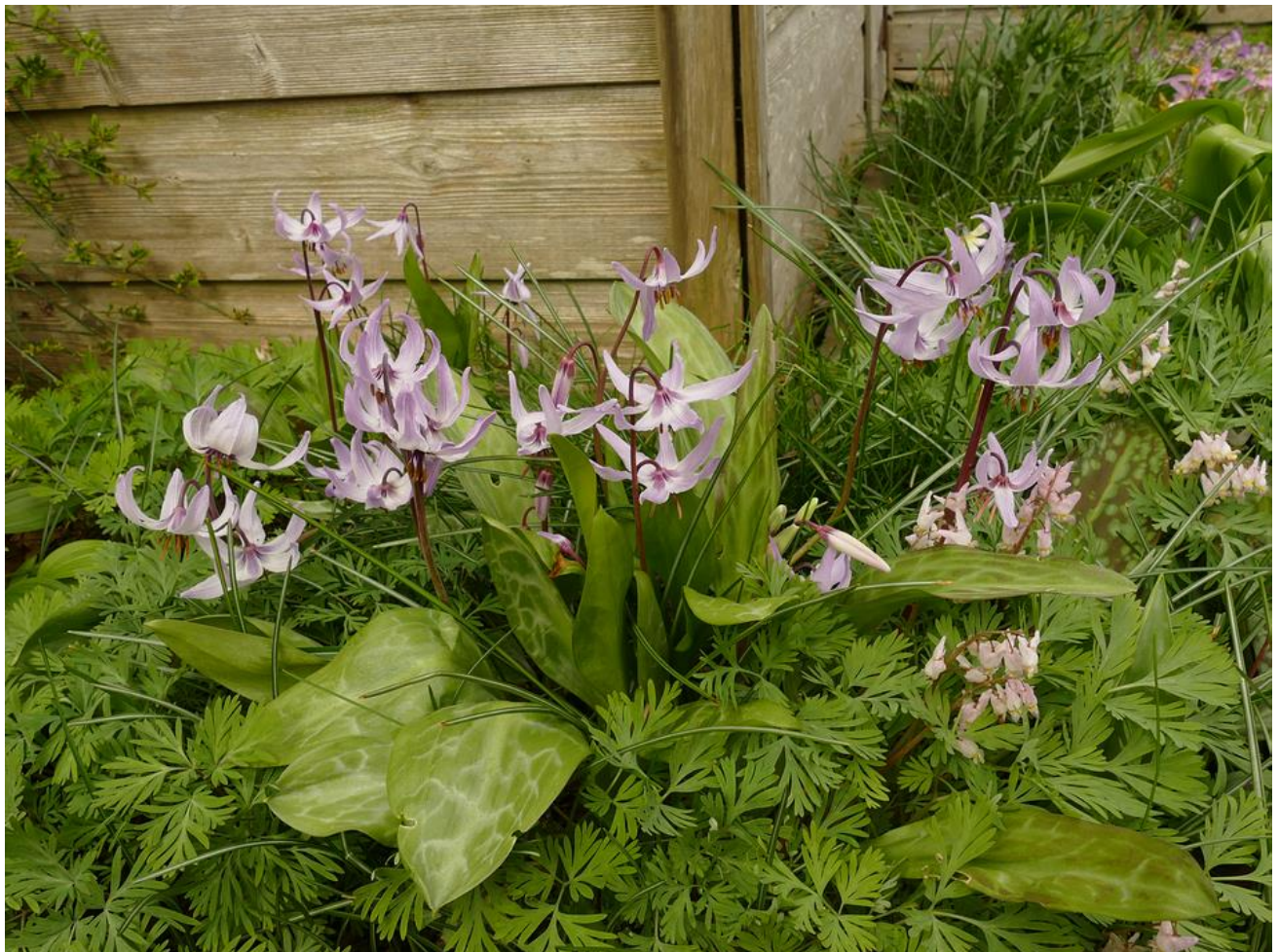
Erythronium hendersonii in the spring growing in the same spot (note the edge of the shed) as the Crocus and Colchicum.