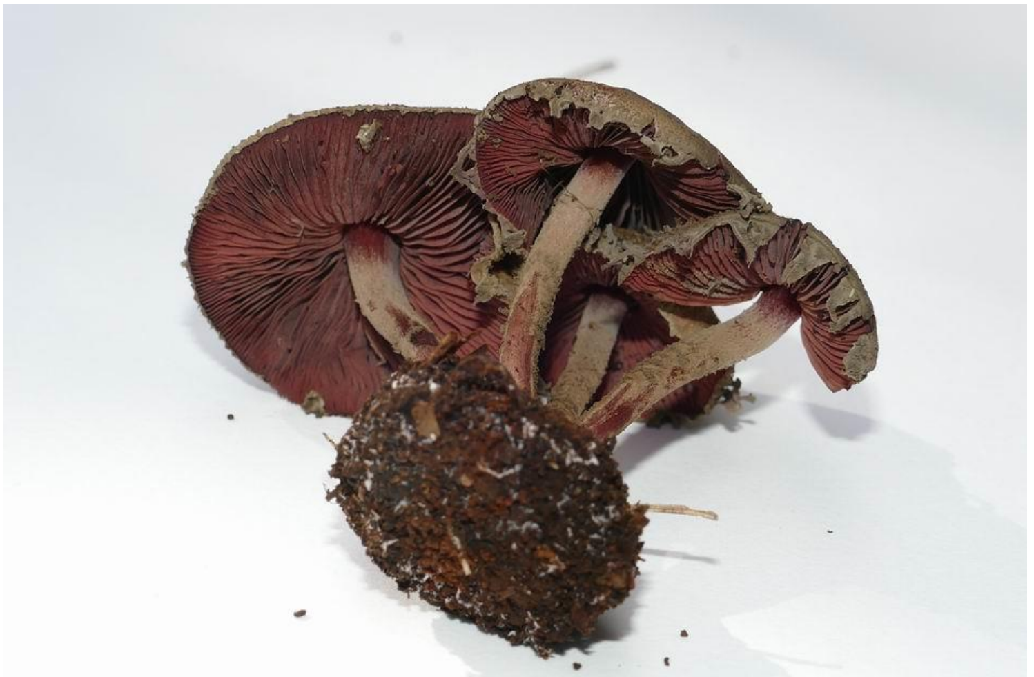
Although fungi can appear anytime they are most plentiful in the cool moist autumn conditions when they are anticipating that the leaf fall will provide a plentiful resource to nourish the mycelium.